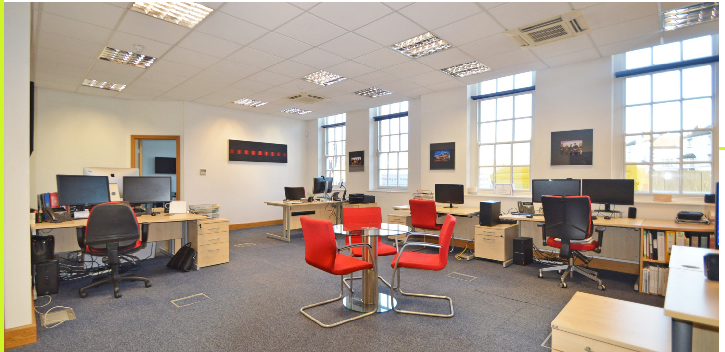
Welsh Bridge, Shrewsbury, SY3 8LH